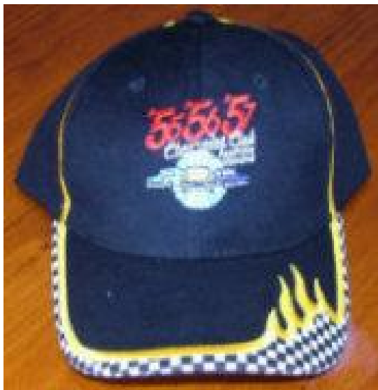
Club Cap $20.00