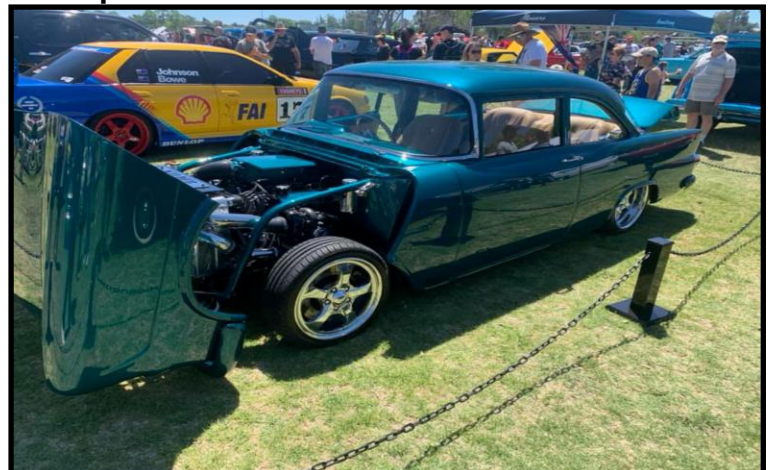
Car Of The Show