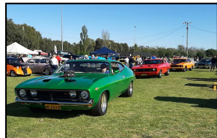
The Falcon Club were out in force!