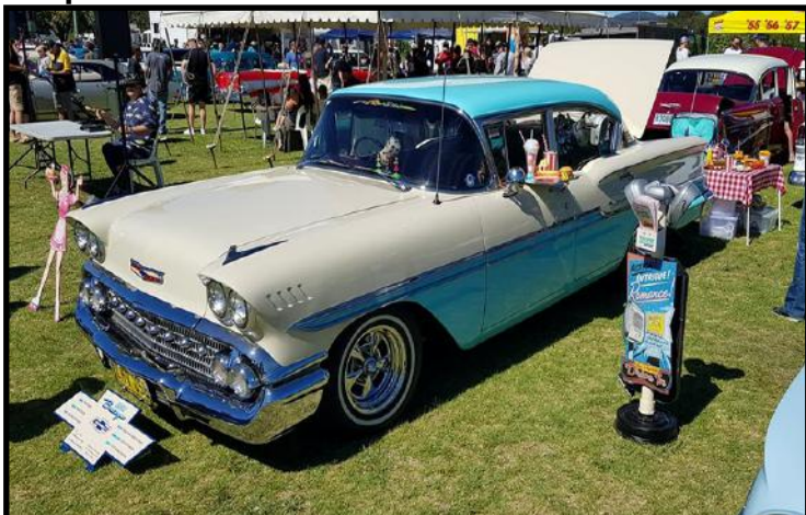
60th Anniversary for 1958 Chev