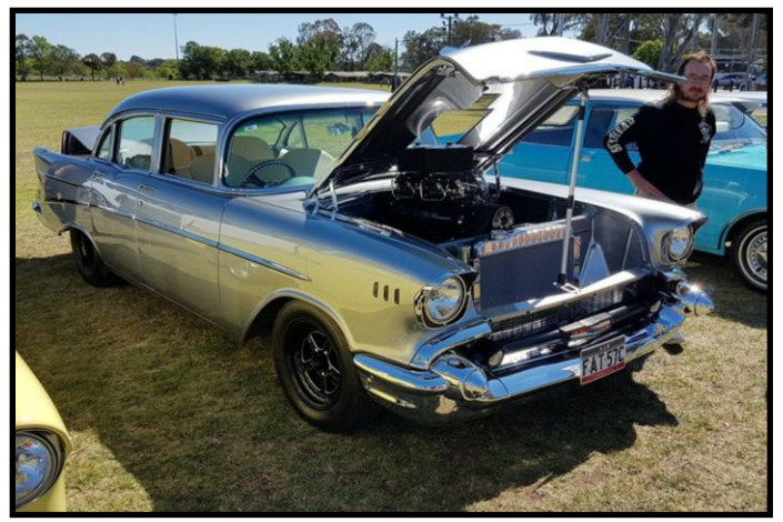
2nd Top '57