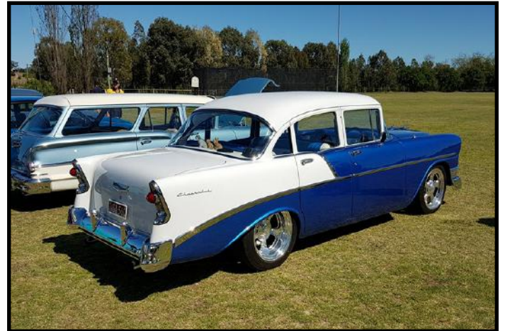
2nd Top '56