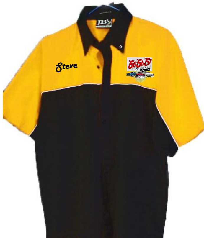
Bowling style shirts Mens Shirt $45.00