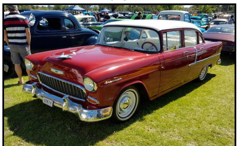
It must be something about 'Adams' and '55's. Slick as.